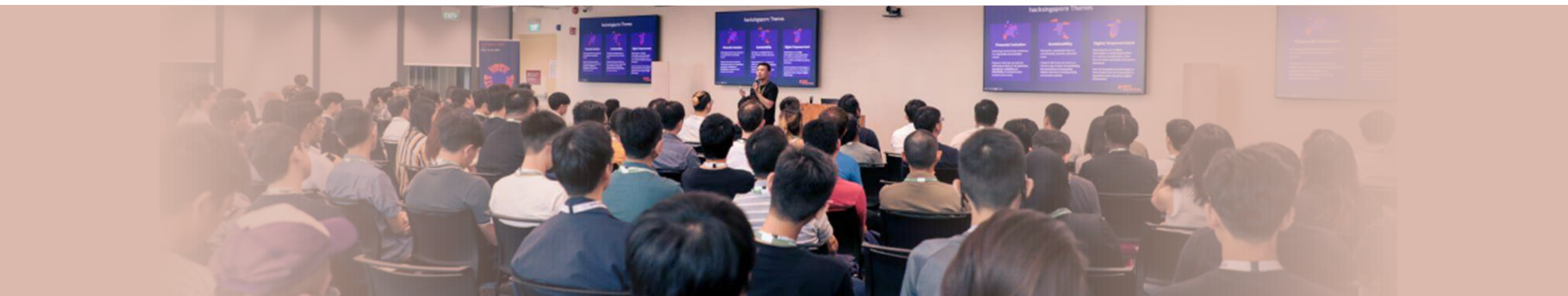
Source: 20+ Developers Dive into Cloud-Native with VMware Tanzu at AngelHack Singapore

VMware partnered with AngelHack to introduce over 20 developers to VMware Tanzu, fostering innovation and supporting winning hackathon projects through hands-on workshops.